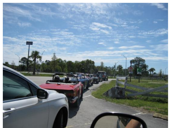
Pulling out for the fun part of the trip