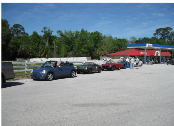
Some lined up at the US 1 Rest Stop

Triumph Club of North Florida with friends from the MG Club Took part in a fun event on April 9th. We met at the Kings Head Pub in the morning to start the drive down to Ormond Beach. Lance Brazil met us there but was not quite up to the long drive in the sun. It was the perfect day for this, with few clouds and warm breezes and not too hot. A few more folks met us at I-95 and US 1 for the second half drive and stops at interesting sites. We had a van and tow bar just in case (hey, these are antique cars).