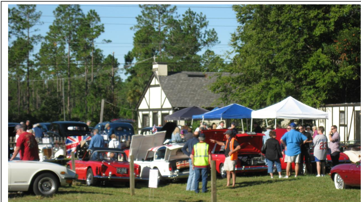
TCNF members in safety vest working out tighter parking by class - guys were working hard that morning